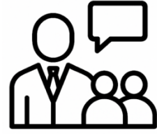
Guided Tours by Experts