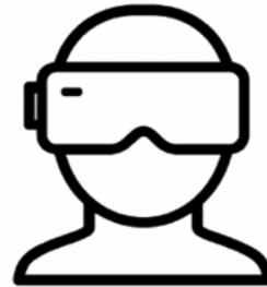
Virtual Reality Tours