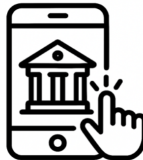
Interactive Museum Apps