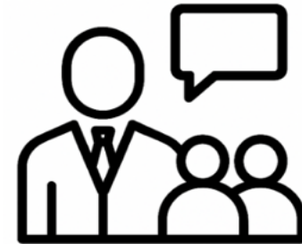
Guided Tours by Experts